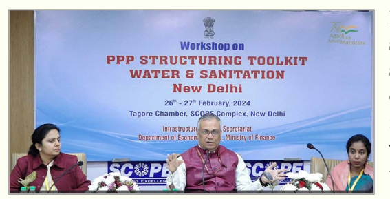
Shri Baldeo Purushartha, Joint Secretary (ISD), DEA addressing participants of workshop on PPP Project Structuring Toolkit

IFS has been conducting a series of workshops on PPP Project structuring toolkits for various infrastructure sectors to sensitize stakeholders on use of the web-based tools developed by DEA for project evaluation. A two-day workshop was organized during 26<sup>th</sup>-27<sup>th</sup> February 2024 through Hybrid mode to demonstrate the use of the web-based toolkit for evaluating projects in Water & Sanitation sector . The workshop was attended by 70 + representatives of Central & State/ UT government departments, private players & consultants who were explained the working of five integral components of the toolkit with the help of case studies for practical understanding & effective implementation.