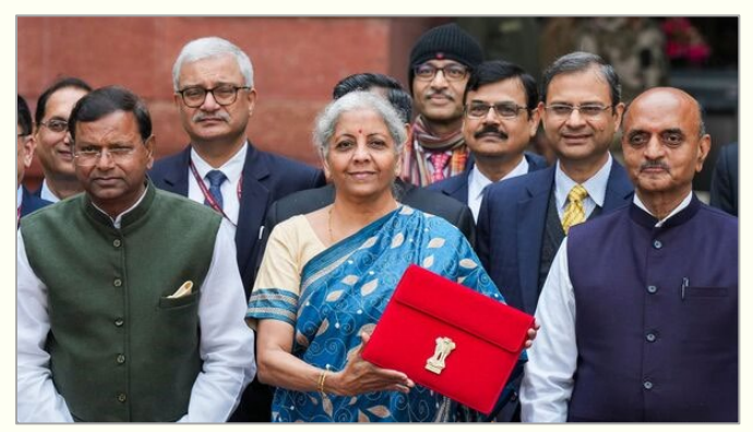
Honorable Union Minister of Finance and Corporate Affairs, Smt. Nirmala Sitharaman presented the Interim Budget for Financial Year 2024-25

India has been fast-tracking on high-growth trajectory to achieve its development targets. The Interim Union budget 2024-2025 has envisioned 'Viksit Bharat' by 2047 to achieve all round, all-pervasive and all-inclusive development. As per advance estimates of National Income of FY 2023-24, India's Real GDP is projected to grow at 7.3 per cent , which is in line with the revised growth projections by RBI for FY2023-24. As per IMF's World Economic Outlook, India is currently the fifth largest economy and is likely to become the third-largest by 2027 . The vision of Viksit Bharat can be achieved through development of modern physical, digital and social infrastructure.